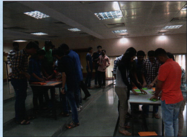
Soft skills workshop in progress