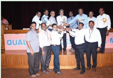
Winners Receiving the Awards

QC case studies were presented by the QC teams in two parallel sessions conducted at Sarabhai Auditorium and Raja Ramanna Auditorium. Twenty four QC teams and nominated delegates from all groups of IGCAR (about 300 members), MAPS and Schools around Kalpakkam presented the QC case studies in a wide spectrum of topics covering Technical, Research & Development, Services, and Education. Six professional judges from QCFI, Chennai chaired the QC case study presentations. Under 'Mechanical & Manufacturing' category, PLUTONIUM team from MC&MFCG bagged 'Dr Placid Rodriguez Memorial Trophy', while FERMI team from MC&MFCG bagged the 'Shri M. K. Ramamurthy Memorial Trophy' for the 'Technical Services' category. As part of QCAM-2018, Slogan and Poster competitions were conducted on theme titled "Role of Quality Circle in Digital India Mission". The winners and