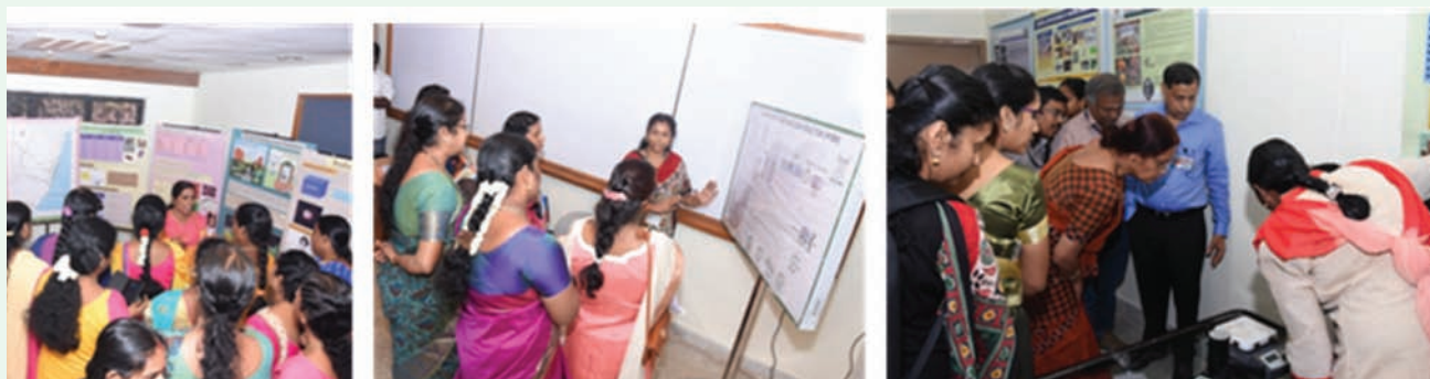
Colleagues from our department demonstrating the exhibits to the participants